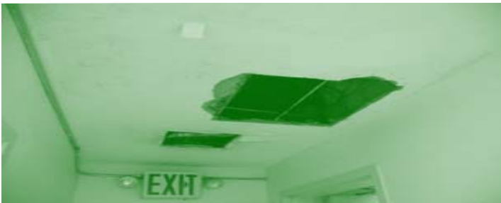
Recent water damage caused by aging plumbing infrastructure. Similar damage has occurred in the Mellin-Macnab lobby ceiling pictured above.

The Church's facilities are in constant use throughout the week. A study conducted in 2005 reported that an average of at least 500 people entered and exited the Mellin-Macnab Church House each day for meetings,