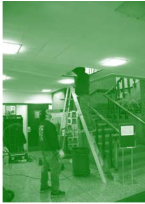
Water and electrical repair in the Mellin-Macnab lobby

After 50 years of nearly round the clock use, seven days of the week, our Church home is showing signs of wear. Not only is the building inadequately lit, the outdated floor plan restricts the flow of traffic on Sundays and during busy weekdays. Restroom facilities need improvement throughout the building and infrastructure elements including electrical, fire-safety, plumbing, heating and ventilation, and communication systems require frequent and costly maintenance.